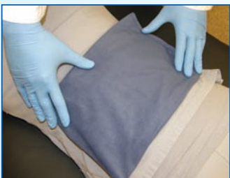
Sleeves sold separately $3.25.