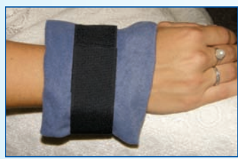
Sleeves sold separately $1.75.