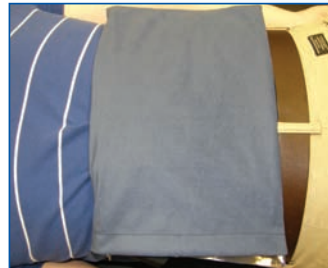
Sleeves sold separately $3.50.