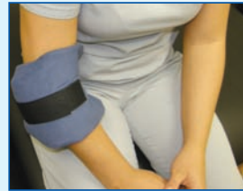
Sleeves sold separately $1.75.