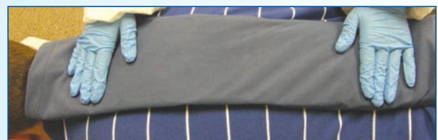
Sleeves sold separately $4.00.