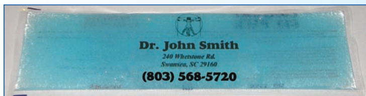
Sleeves sold separately $2.75 for 10" strap or $3.25 for 18" strap.